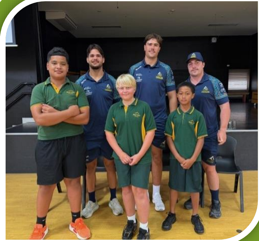
Brumbies ACT Rugby Union Team visits Red Hill Primary.