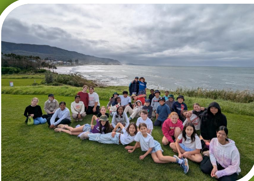
Year 6 students at camp enjoying the beautiful views at Sandon Point overlooking McCauley's and Thirroul beaches.