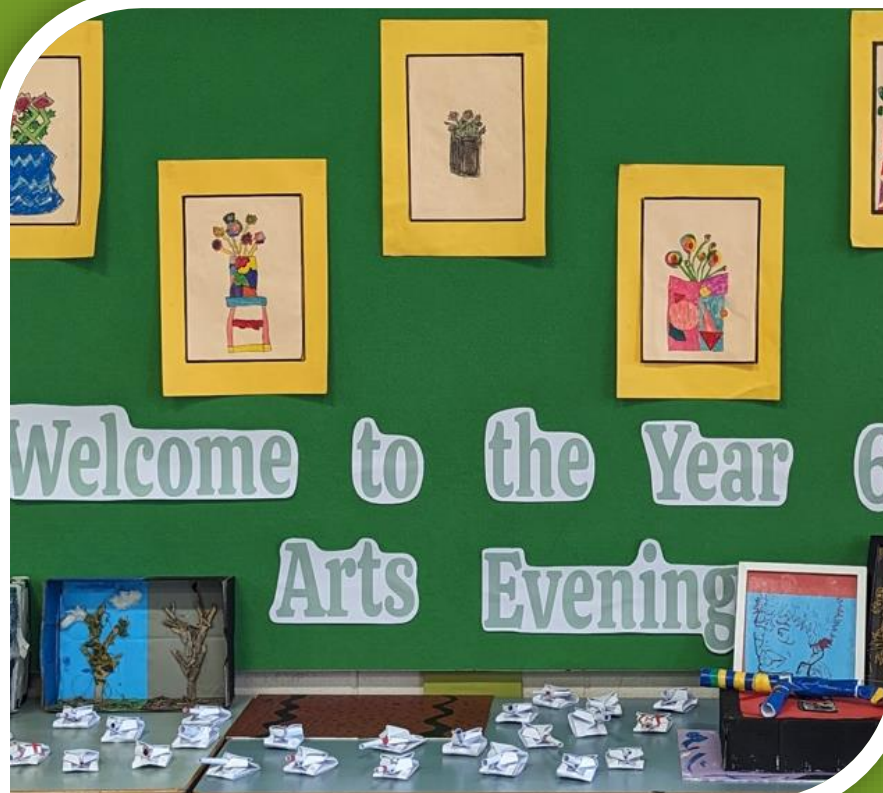
Artwork from the Year 6 Arts Evening.