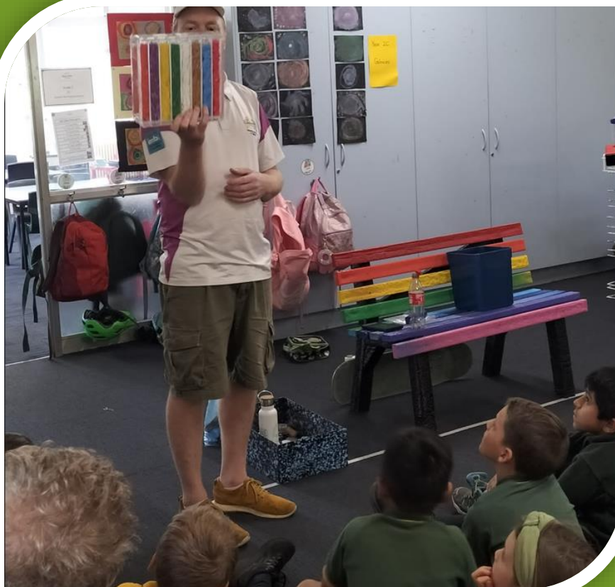
Year 2 students listening to a recent talk from 'Lids 4 Kids'

Red Hill School is a Nut Free Environment