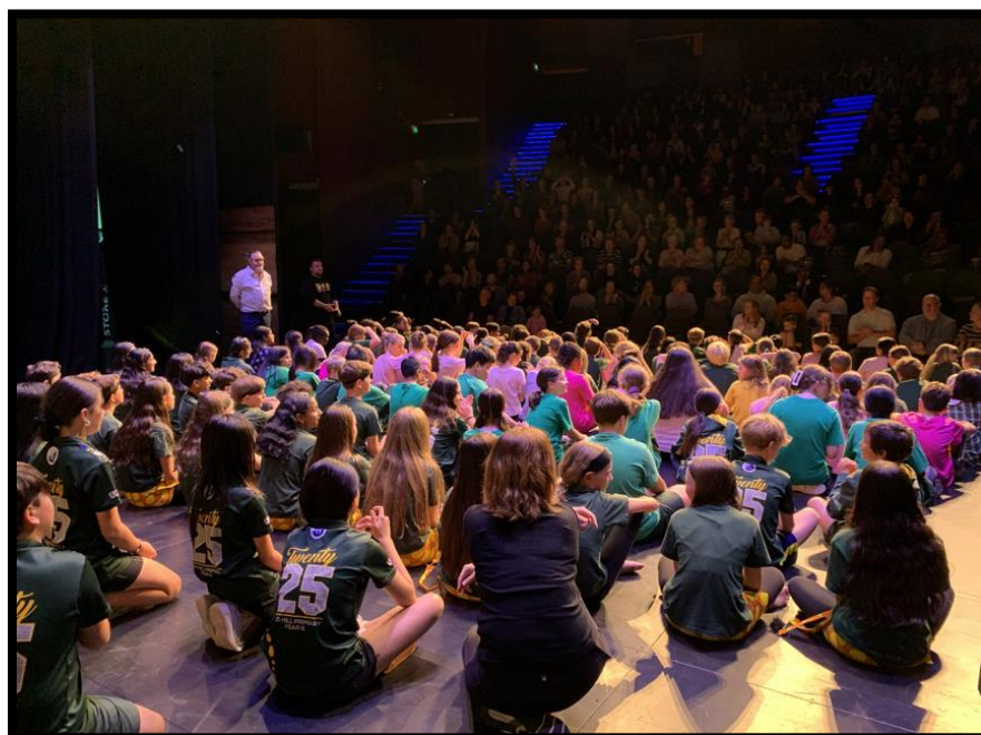
End of a wonderful Spotlight evening.