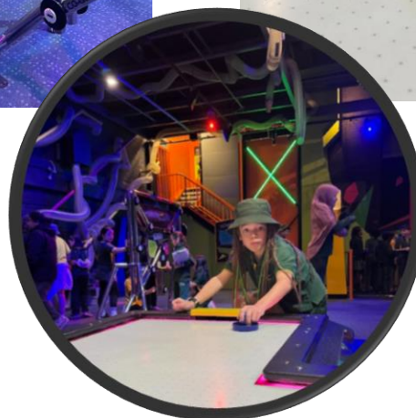
Year 5 excursion to Questacon