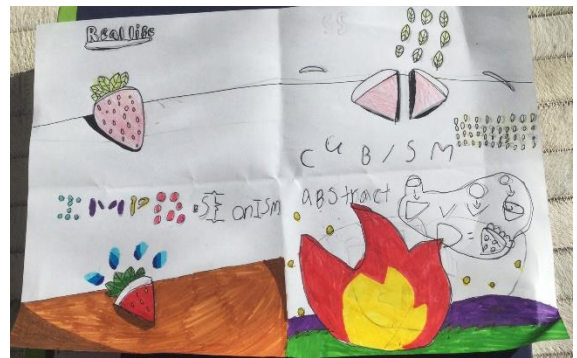
Four Way Fruit Study Lucie