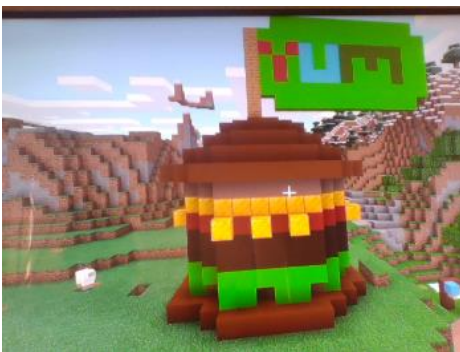
Yummy food, Yucky Food Hunter