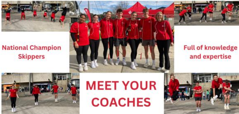
National Champion Skippers

Skipping workshops will run each Saturday with our next program scheduled from SATURDAY 9 AUGUST 2025 until SATURDAY 13 SEPTEMBER 2025.