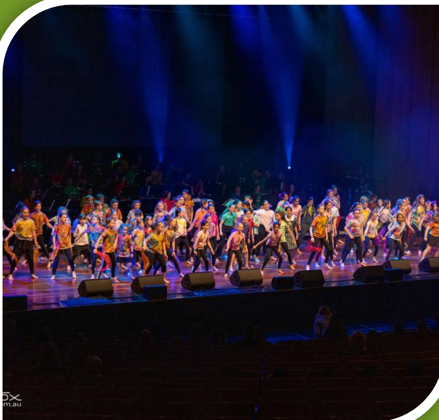
Limelight dance group at the Limelight show.

Red Hill School is a Nut Free Environment