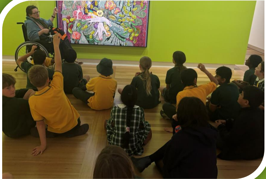
4CB being inquirers by asking questions about a portrait of Maggie Beer by Del Kathrine Barton at The National Portrait Gallery