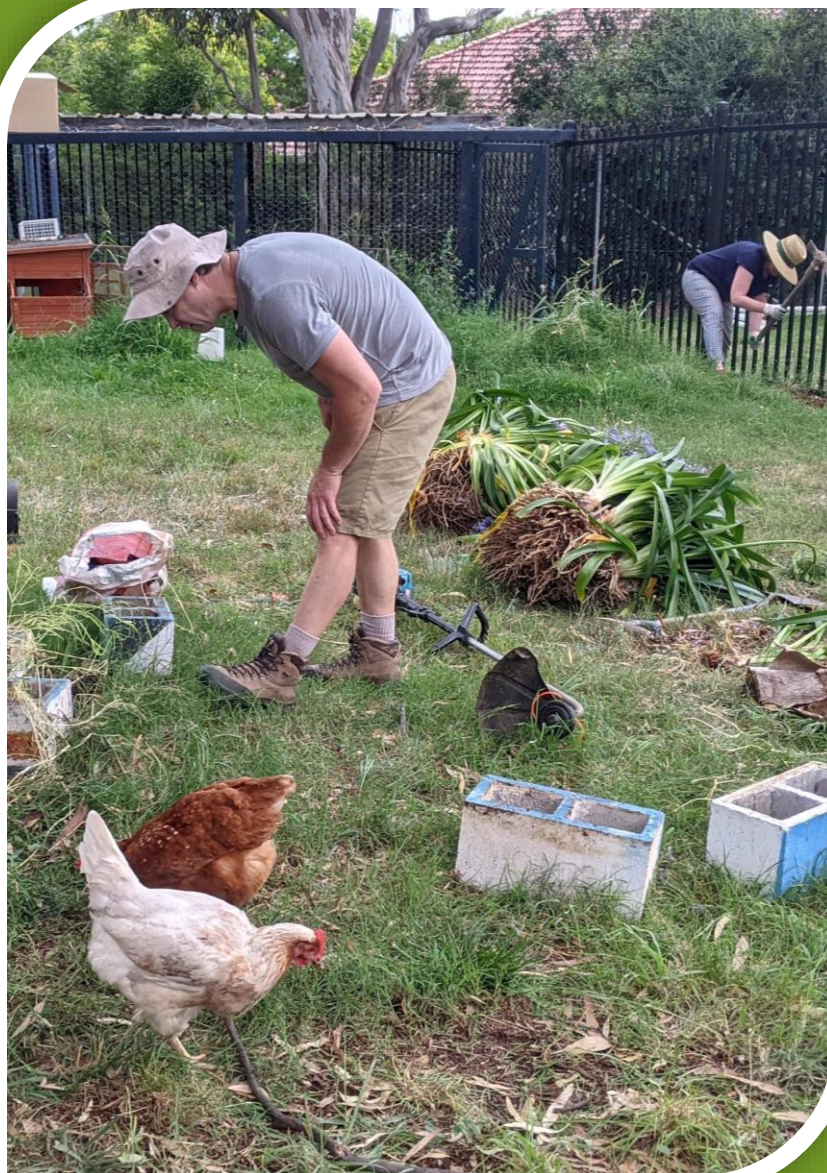
School Garden Working Bee