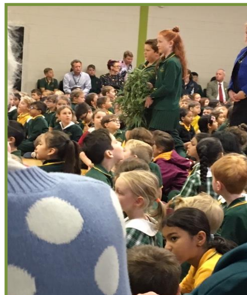
Captains and the school Wreath

‘Anzac days means to me to remember all those brave souls who served this fair nation. We respect and appreciate what they have done for this wonderful country. No matter what we shall still commemorate this day as ANZAC Day.’ By Abi