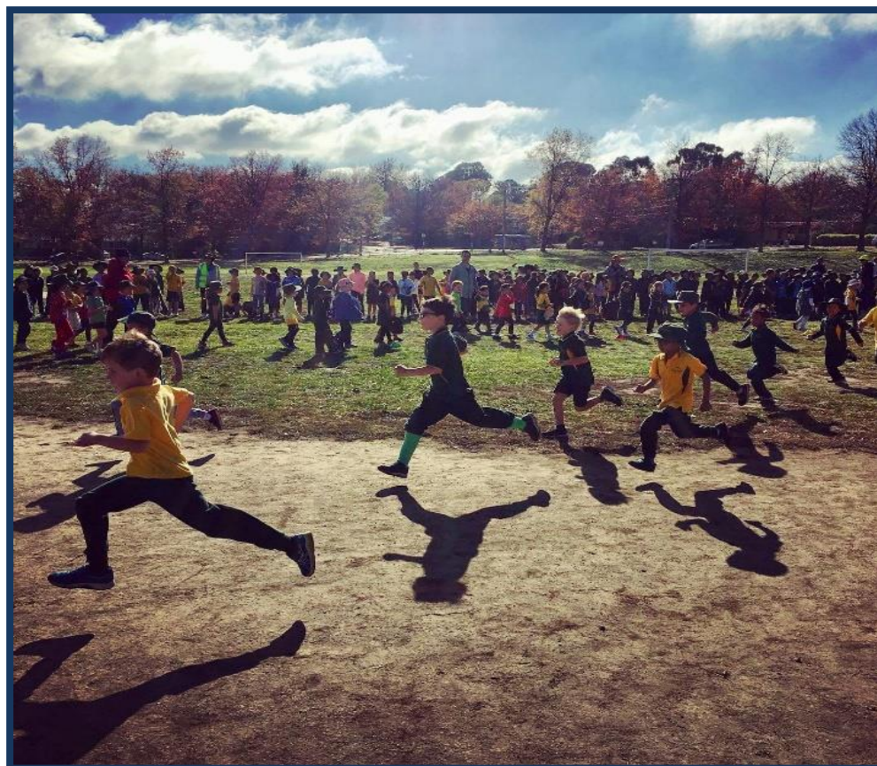
Year 1 boys running the cross-country