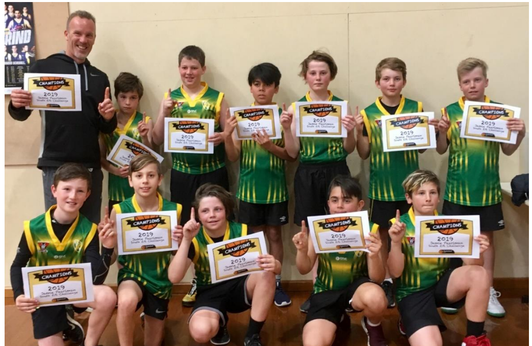
Year 5/6 Boys Jamie Pearlman Cup Basketball Competition