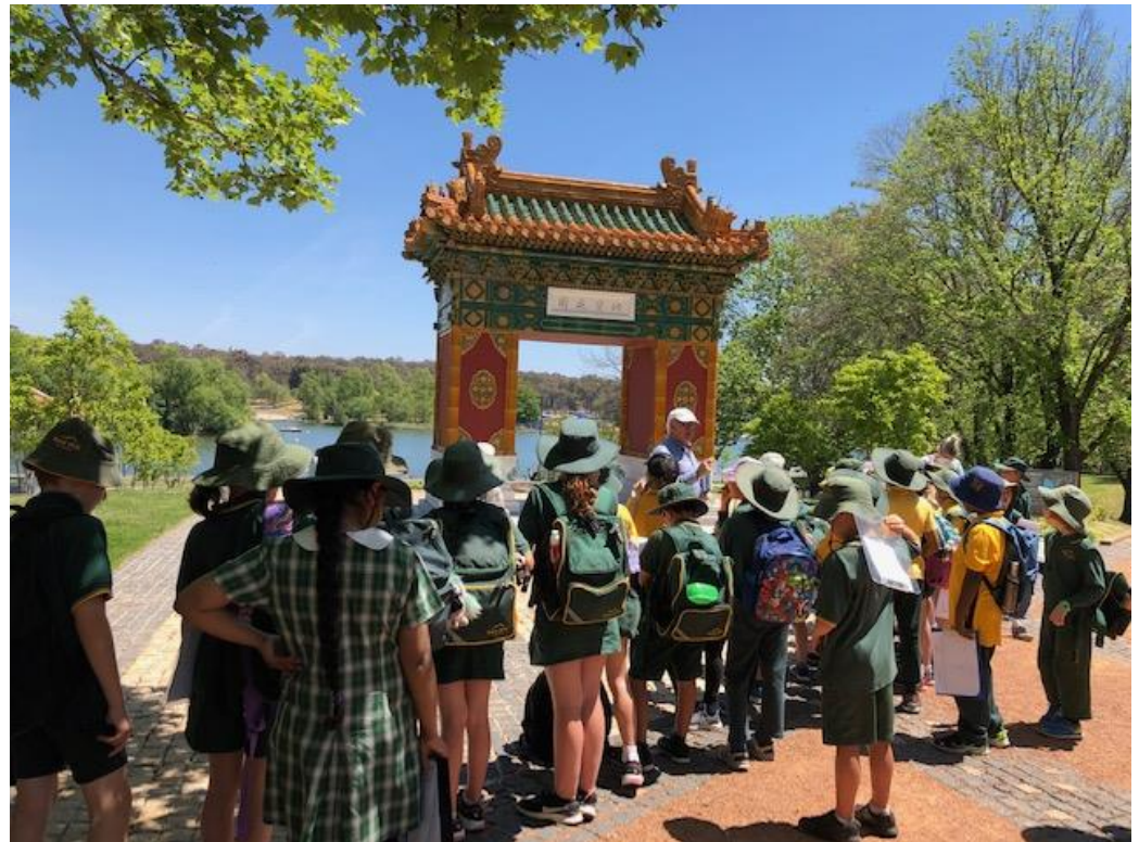
Year 3 at Nara Peace Park where they visited the Chinese monuments, Japanese monuments and rang the peace bell.