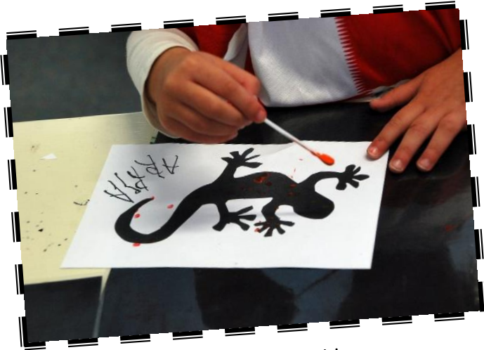
Harmony Day activities

We are now moving onto our next inquiry Sharing the plant . The central idea is “Nature Opens Our Hearts and Minds”. We are just beginning to investigate this, and we are enjoying circle times with nature and connections as our focus.