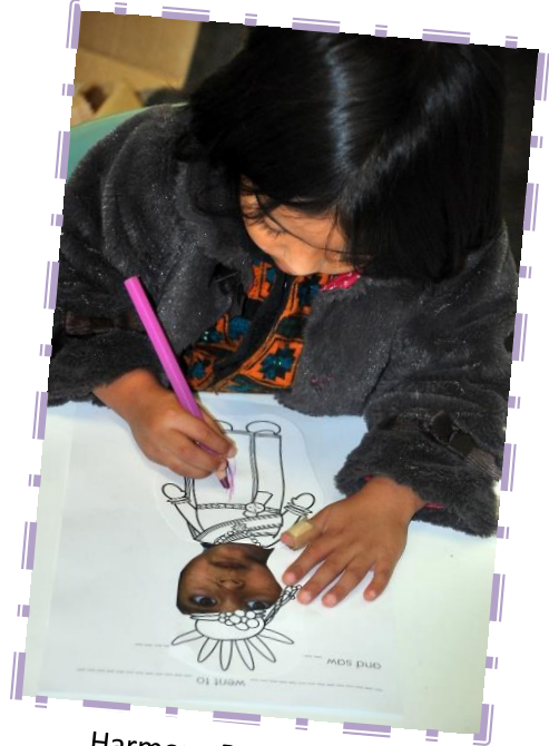
Harmony Day activities