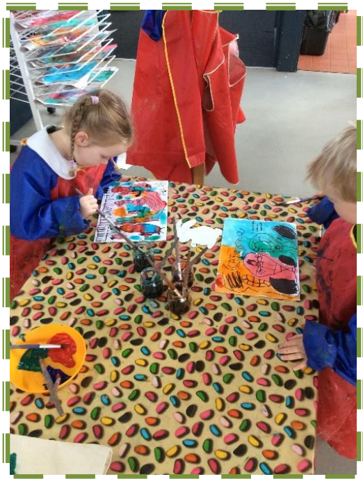
Drawing, discussing and painting the things we like to play with at Red Hill Preschool.