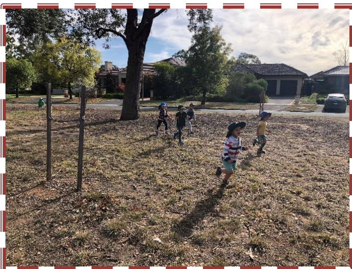
Exploring the space outside and different types of play at Griffith Preschool.