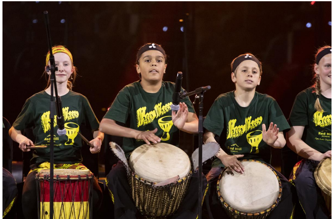
Wassa Wassa 2019 Limelight Performance